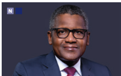
Aliko Dangote, GCON Chairman

Key A Audit, Compliance and Risk Management Committee F Finance and Investment Committee T Technical and Sustainability Committee R Remuneration, Governance and Nomination Committee N No Committee ■ Chairman