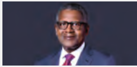
Aliko Dangote GCON Chairman Attendance ●●●●●