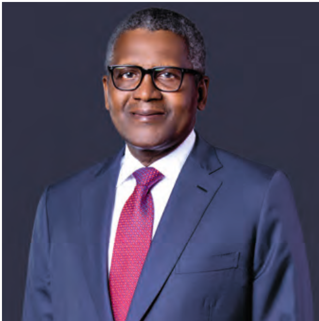
Aliko Dangote, GCON Chairman

Distinguished shareholders, it is my pleasure to introduce this Corporate Governance Report, which forms part of the Report of the Directors and which sets out the principles by which Dangote Cement Plc is governed.