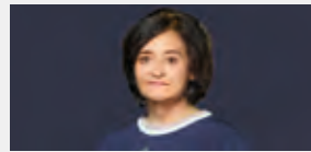
Cherie Blair CBE, QC Independent Non-Executive Director Attendance ●●●●●